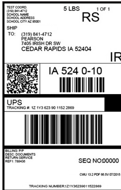
UPS Shipping Label

Follow the instructions below when contacting UPS to return your AzSCI Nonscorable test materials.