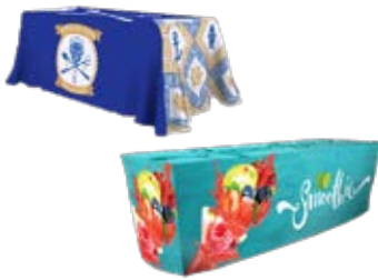
Table Throws - Standard & Fitted

Table throws are a great addition to your trade show booth or event. Table throws come in 6ft and 8ft, fitting most standard tables. Custom printed edge-to-edge, the full length material will cover the front, back and both sides of the table. Stretch fitted fabric is available.