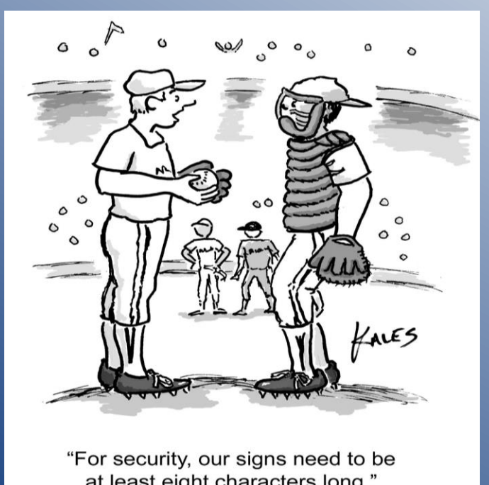
at least eight characters long."