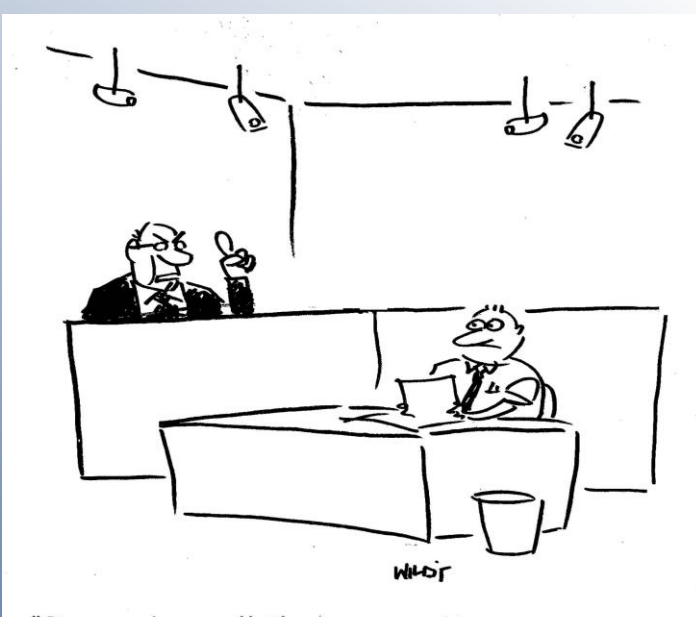
"Remember, all these security cameras are for YOUR protection...otherwise, I'd come over there and smack you."