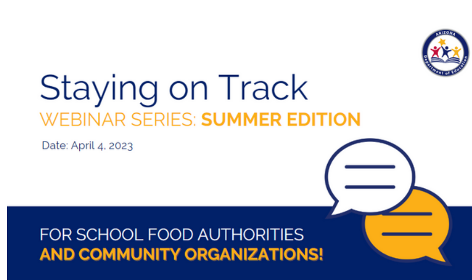
April Staying on Track: Summer Edition

To access webinar slides and recordings, visit HNS' webpage or refer to the HNS Communications Event Follow-up email.