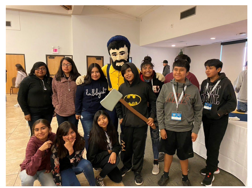
Casa Grande Elementary, JOM 2020