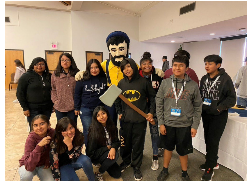
Casa Grande Elementary, JOM 2020