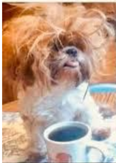
Zoom meeting, audio only