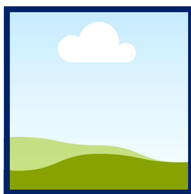
NEW Vacant Equity & Inclusion Chair,