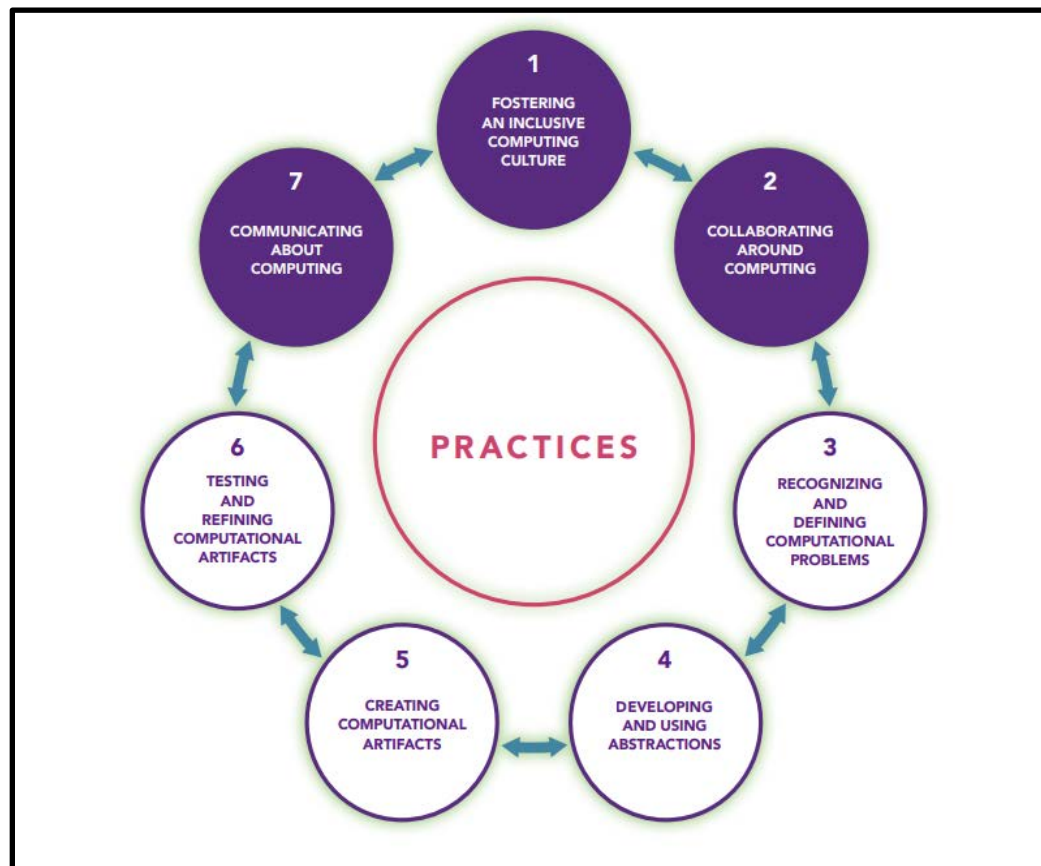
Figure 2: Practices- K-12 Computer Science Framework. (2016)