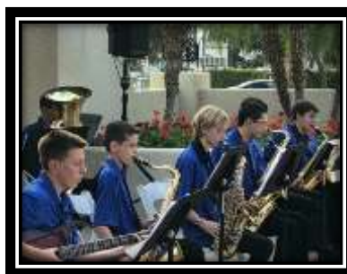
JO Combs Jazz Band

Take a moment and watch how Amazing our student performers were! This clip features the Buena Show Band from Sierra Vista!