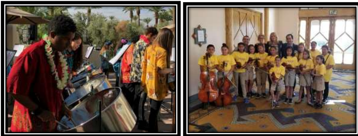
Country Gardens Charter School Steel Drums Band – Harmony Project Phoenix students